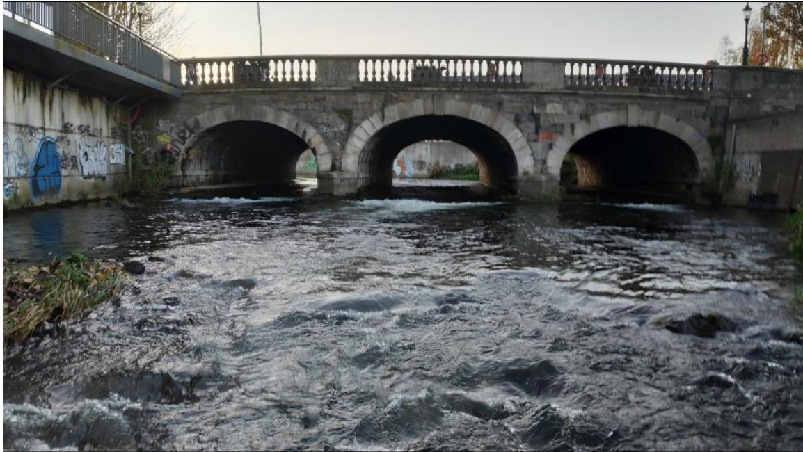
Plate 3.3 Representative image of site T3 on the River Tolka at Frank Flood Bridge (facing upstream)