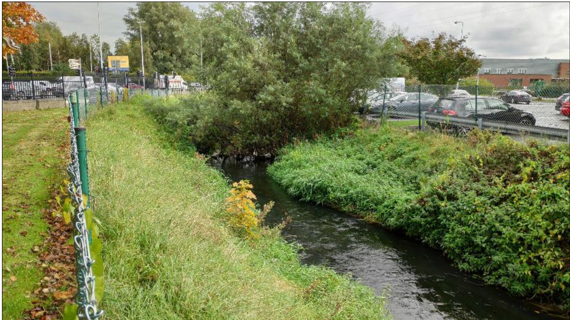
Plate 3.10 Representative image of site C2 on the River Camac (upstream of the culvert)

The presence of a healthy Annex II white-clawed crayfish population, in addition to excellent brown trout habitat and good lamprey habitat summarizes the key habitats found at this site.