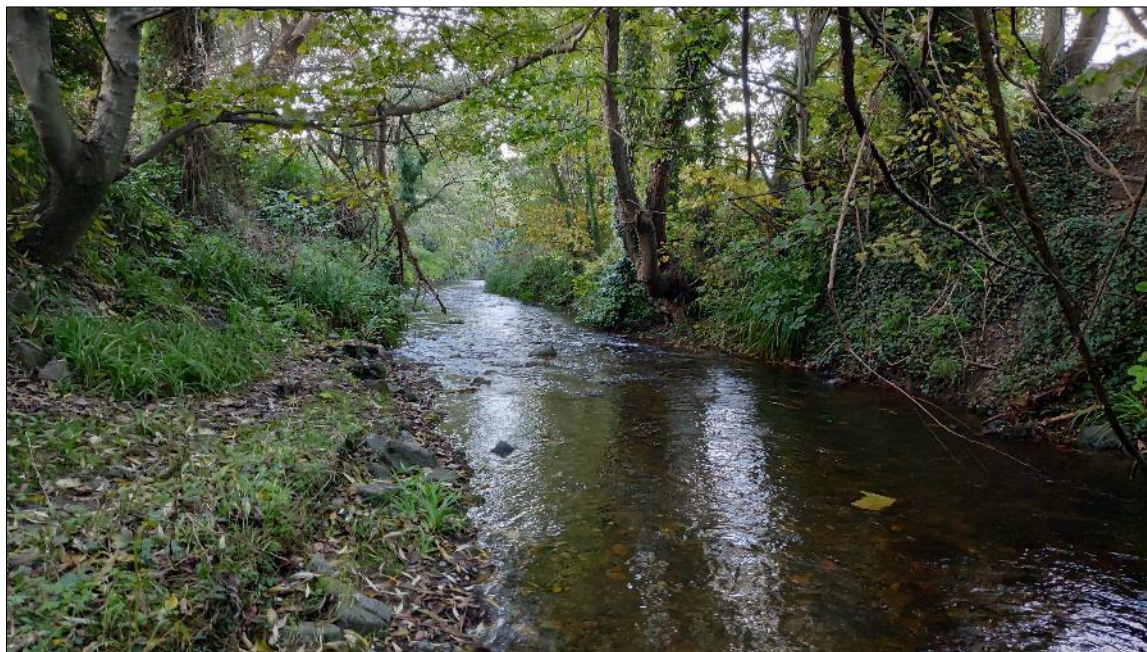
Plate 3.7 Representative image of site O3 on the Owendoher River (facing downstream)

In summary, site O3 showed excellent salmonid habitat with good habitat in particular. Additionally, habitat with high otter potential (including a possible breeding area) was also noted.