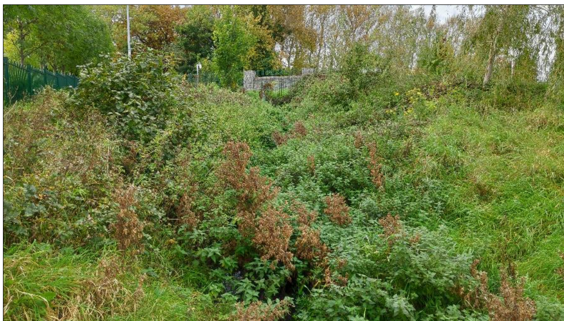
Plate 3.12 Representative image of site P1 on the upper reaches of the River Poddle (heavily scrubbed-over, facing upstream to road crossing)