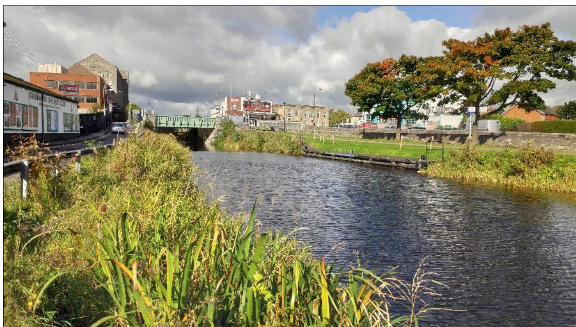
Plate 3.4 Representative image of site RC1 on the Royal Canal at Phibsborough (5 th lock)

In summary, this site on the Canal and situated within the Royal Canal pNHA (002103), exhibited high coarse fish habitat, high European eel habitat, and of high quality for otter as a foraging area.