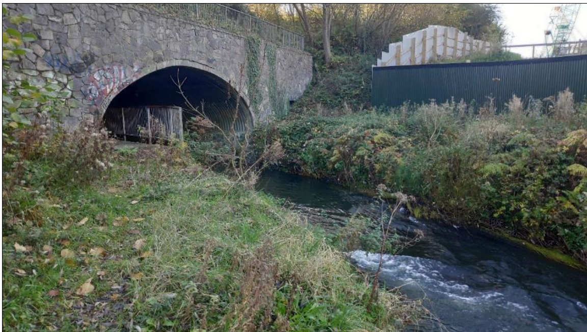
Plate 3.2 Representative image of site T2 on the River Tolka (facing upstream towards culvert)

The site T2 was found to be of moderate salmonid and European eel quality, with observable utilisation by otter.