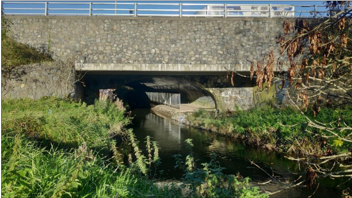
Plate 3.1 Representative image of site T1 on the River Tolka (facing upstream towards culvert)