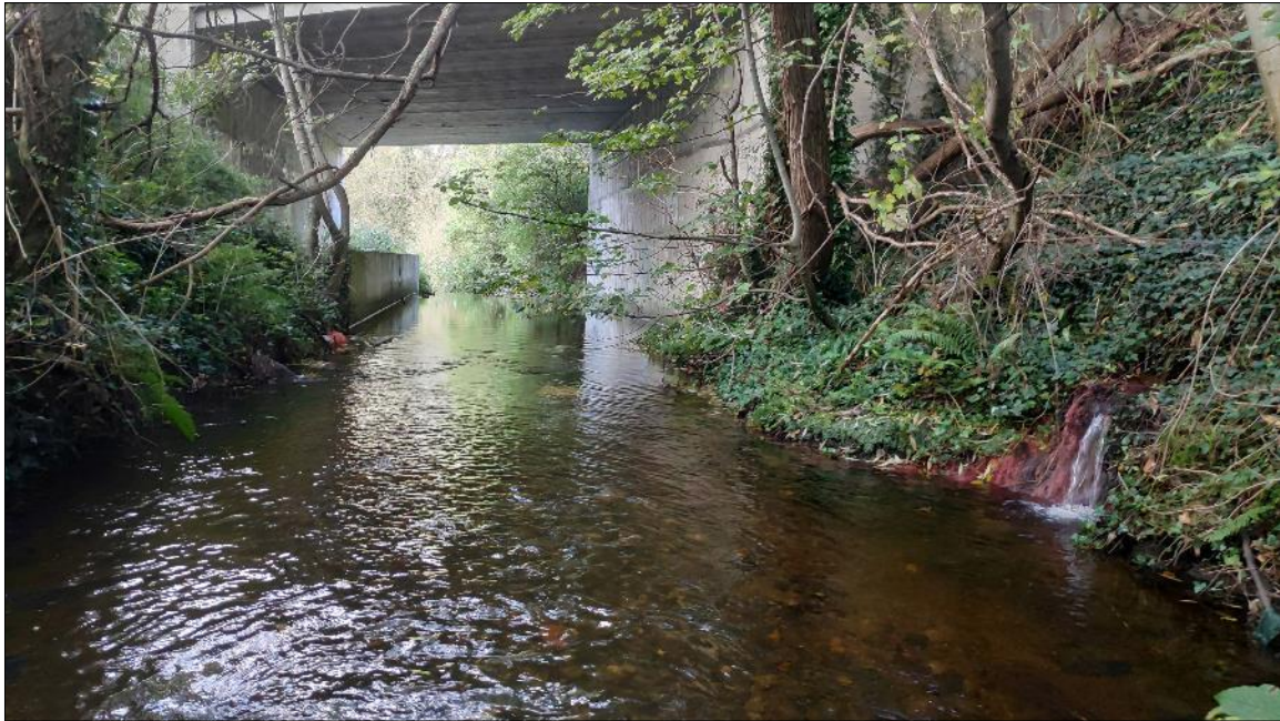
Plate 3.6 Representative image of site O2 on the Owendoher River (facing downstream towards road bridge with point source evident in right foreground)