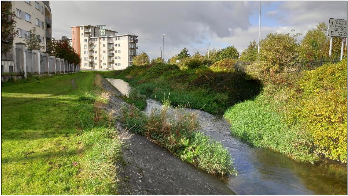
Plate 3.9 Representative image of site C1 on the River Camac (facing upstream)