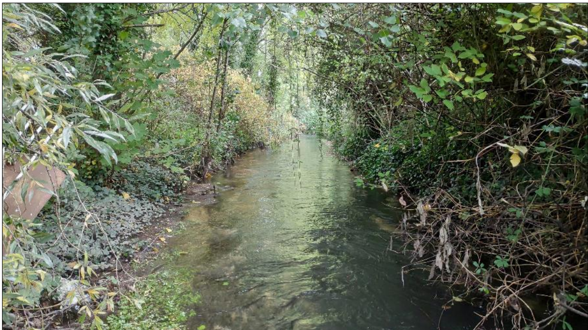
Plate 3.11 Representative image of site C2 on the River Camac (downstream of the culvert)