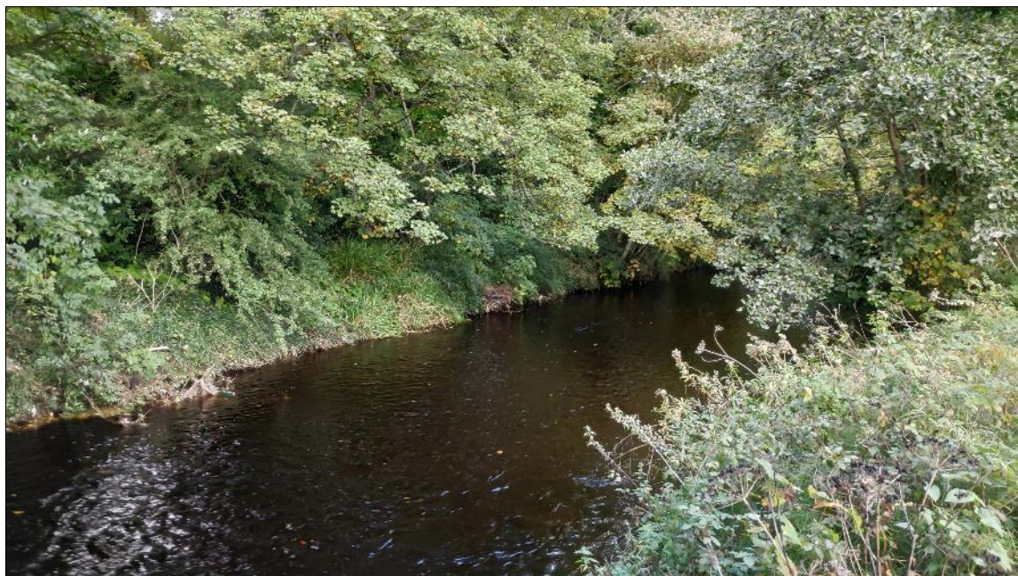
Plate 3.8 Representative image of site D1 on the River Dodder at Rathdown Park

In summary, given the excellent salmonid habitat - in particular spawning gravel, with other areas of good quality nursery and holding habitat observed at this site. Otter activity was not seen at this site during survey, but it is thought that habitat potential at this site was high for this species.